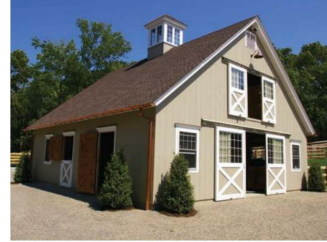
Old Town Barns also helps in the upkeep of the structure so that it looks as new decades from now as it did the day it was finished.