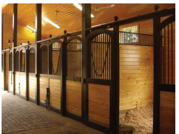
The goal of the company is to produce barns that preserve the traditions of craftsmanship and durability.

For more information as well as a building showcase, visit OldTownBarns. com, or place a call to the helpful customer service team at 845-855-1450.